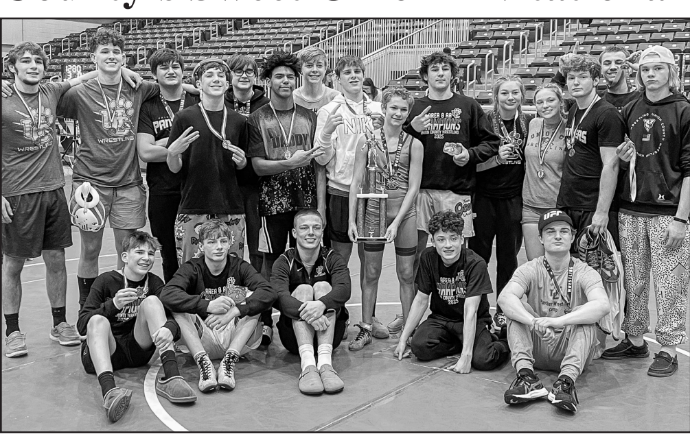
Union County wrestling placed second at Toombs County's Sweet Onion Invitational in their final competition ahead of this weekend's Traditional Area tournament at Stephens County.